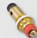
RA-N radiator inserts