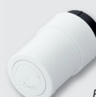
RA 5002 manual hand wheel