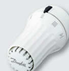
RAE 5054 thermostatic sensor