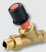
2 AVDO – pressure regulator