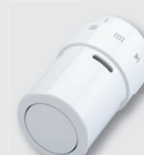
RAX thermostatic sensor