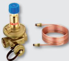
1 ASV-PV – pressure controller