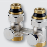
RLV-KS H-piece valves