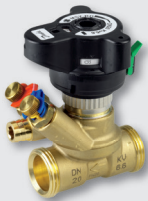
1 MSV-BD – balancing valve

WARNING: This is the Dutch version, please select and check your own product codes. This is just an example. But the selection of products for this selection card will vary per country!