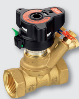
2 ASV-BD – partner valve for pressure controller